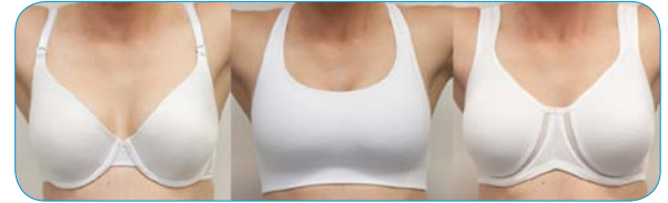
Figure 4 Types of bras

Fashion bra: breasts not completely covered, thin straps, non-supportive material