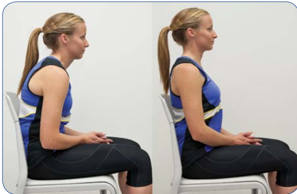
Figure 1 Bad posture (left), good posture (right)

As breasts can be heavy, the force created by them can pull your trunk forward, making you slouch. This can negatively affect your athletic or sports performance, and lead to headaches and neck, back and arm pain 2,3 .